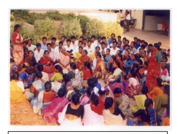
Community Based Organization-Meeting

out-migration for paid labour. A few hundred SHGs of women's federations became the cooperative society, which takes care of the staff of BREDS as their employees and replaced the NGO and marching ahead as a mandal.