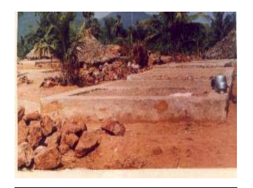
Locally available resources

1990, 1995 and 1996 cyclones. In the reconstruction work after these cyclones, NASA utilized the emotional situations to foster unity among dalits and inspire them Housing provides the best opportunity for such a to build their own future. committed community organization work. The people's organizations are motivated to complete the project by introducing locally feasible cost effective technology, participative, transparent and accountable systems. NASA made use locally available resources for housing such as bricks, rough stones, sand, deadwood etc., to the optimum level. NASA has so far constructed more than 8,000 permanent houses. So far 18,000 acres of land was acquired and developed with special focus on watershed management and by introducing appropriate land development practices. This has immensely contributed to the socio-economic advancement of the dalits. NASA's documents showed that it has promoted 5,000 self-help groups ranging from 10 to 15 members per group and there are 60,000 women involved. They are federated at the macro level as cooperative societies. They are involved in savings, credit, skill development, and income generation and as active participants in socio-economic and political empowerment processes.