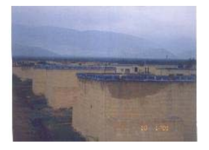
Kurnool Terrace Roofing

The people did not bother about the poor quality of construction and unsystematic infrastructure development because they neither got involved nor contributed anything in cash or kind. Only 850 houses were constructed at a cost of Rs.20, 000/- per house of 144 sq.ft. as per the government's prescribed sizes. The