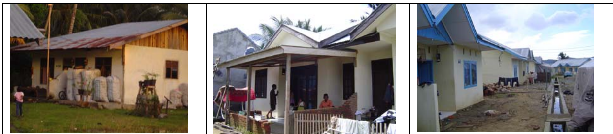
Figure 1: Low Cost Houses for Hospital, Police and Government Workers.

Low cost houses typically had two bedrooms. But the inclusion of separate bedrooms into the UNHCR proposed house was abandoned in favour of one common living area or lounge area. Families would initially live in the living/ lounge area and subsequently extend the house to suit their requirements. This subtle but important design aspect was not well understood but can be understood when one considers the family