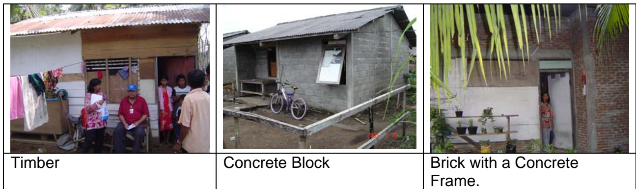
Figure 3: Local Cladding Options for Low Cost Permanent Housing in Aceh

The complexity of what is apparently a straight forward issue can be gauged from table 1 below. Many do not understand the “balancing” process involved in selecting cladding nor the process and design of shelter let alone permanent shelter. Nonetheless, this has to be done and initially because of cost it was felt that the cladding selection tended towards timber but with the proviso that availability be confirmed at each location. This was countered by the need to complete a sustainability evaluation and the need to ensure that a sustainable harvesting scheme was adopted. There was a concern with the perceived quality of timber over the other two hard surface materials. This was confirmed both by UNHCR’s spatial survey of low cost housing in Bandar Aceh and by national construction figures obtained from BPS (Indonesian Government Statistics Department) that 95% and 94% of houses had hard surfaces. This was countered by the traditional wooden house (more common in rural areas) and the feeling amongst UNHCR national staff in Bandar Aceh that if you did not have a house than any house was a better option. Thus, in the initial stages timber appeared to have potential advantages over the other two options.