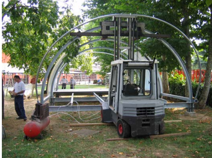
Picture 7-8-9 Horizontal load tests have been carried on the prototype by applying hydraulic jacks to the main frames and to the secondary structure.

Static analysis on the simple automatic model has given very good results compared with the real behaviour of the prototype. After analysing a partial model and testing the prototype on site, under horizontal loads to verify the increasing rigidity of the system due to shell panels, a full complex model automatic has been completed. This model has been finally checked under single or combined load actions (permanent loads, variable loads, snow, lateral winds, frontal winds, earthquake). All stress and strain outputs have been inside the limits of safety and functionality, previewed for this typology and for the applied materials.