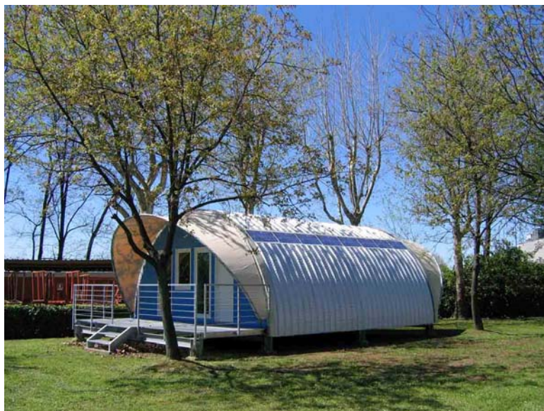
Picture 1 – Prototype of L'Armadillo in Carate Brianza (MI) integrating photovoltaic cells on the top.

The design approach has similarities to the one used in the car industry, where options can be added to the basic version. As a matter of fact Self Supporting Corrugated Steel Shells have also been used by the military for many decades but Armadillo is a different thing for many reasons. Armadillo is a “mecano kit” and this allows to be transported in rather small parts, on the contrary self-supporting shells needed big spaces to be transported, therefore only with military trucks and never stored in a container like the Armadillo is. That’s why there isn’t need for making the arches self supporting but using them only as envelope and use the steel “skeleton” structure as bearing frame. This solution allows also to reduce as much as possible the foundations to few points instead of be obliged to design a foundation platform (therefore using a lot of water which can be a problem in some regions) like military shells needed.