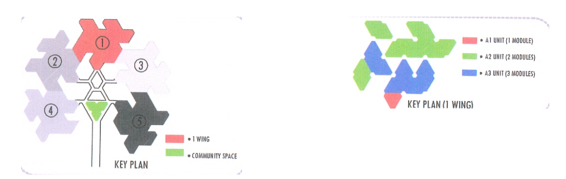
Fig. 4. Post-Emergency Phase