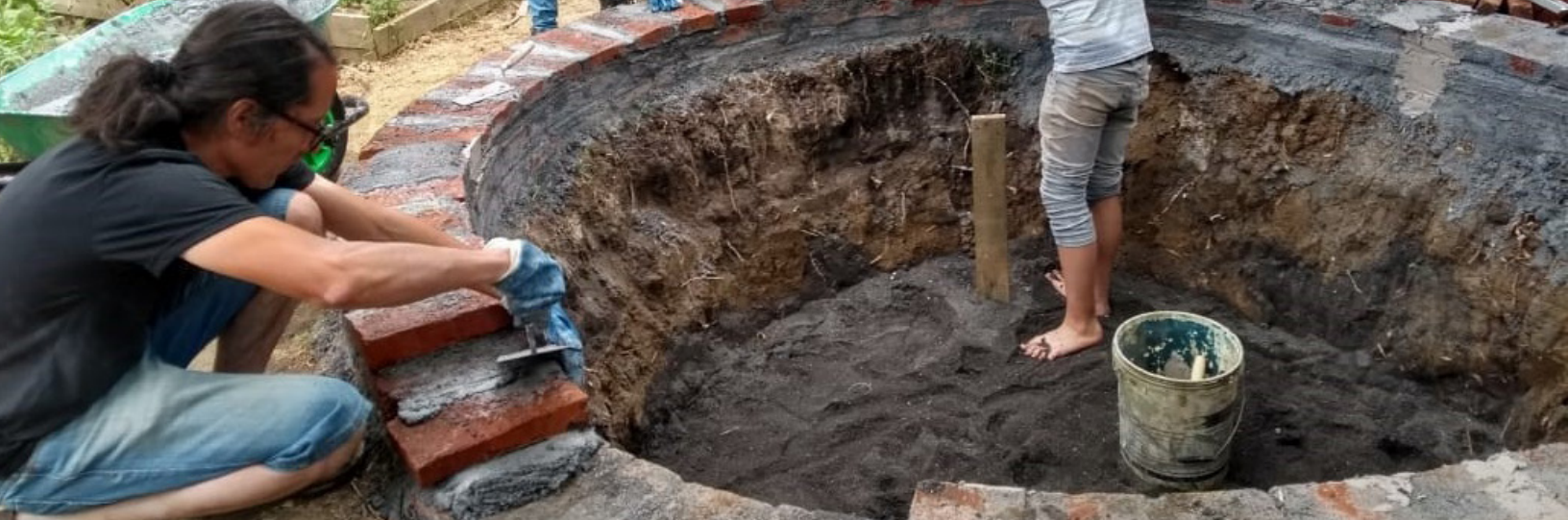
Fig. 2: Construction of the worm filter.