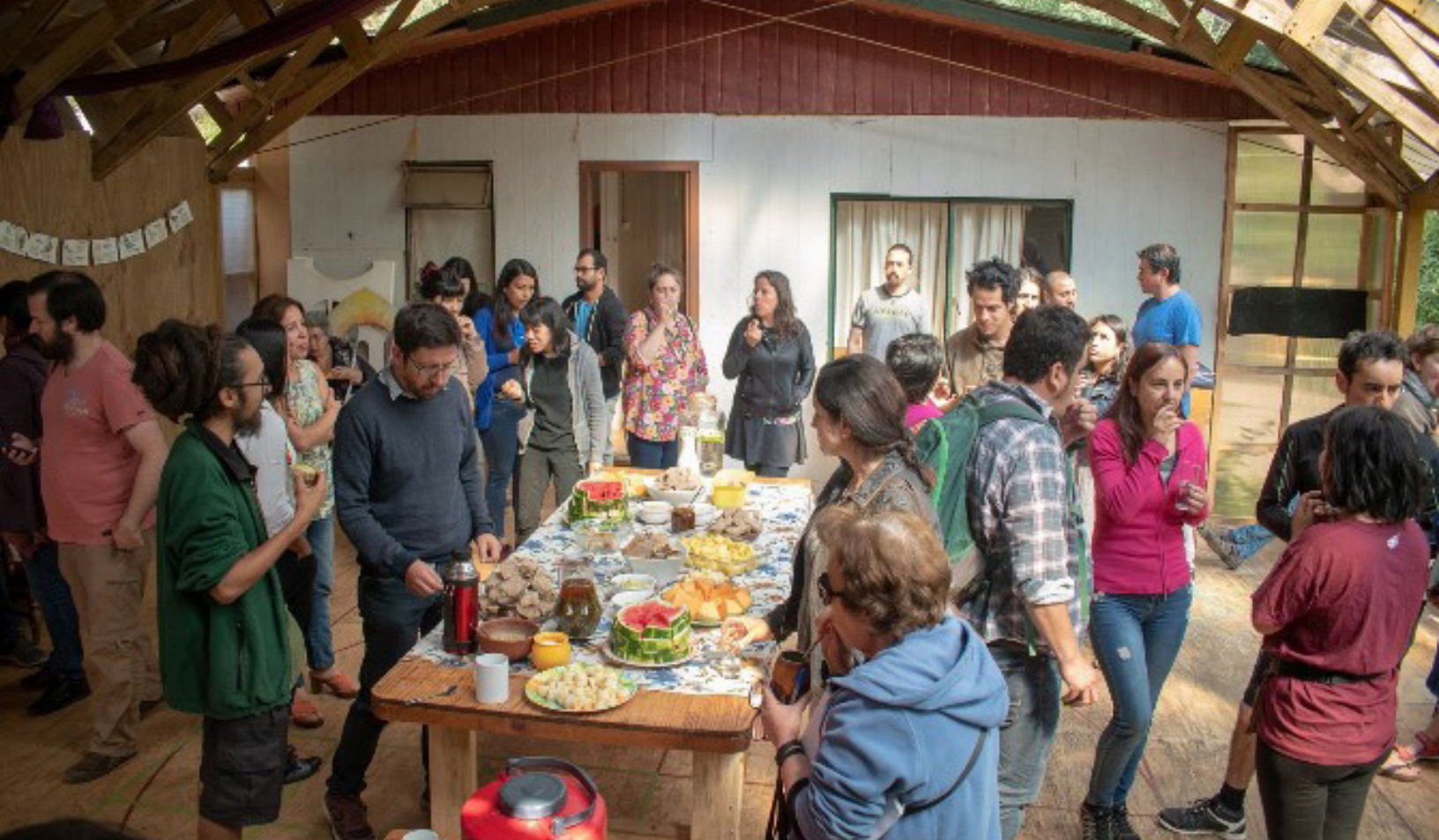
Fig. 8: Day of the talk.