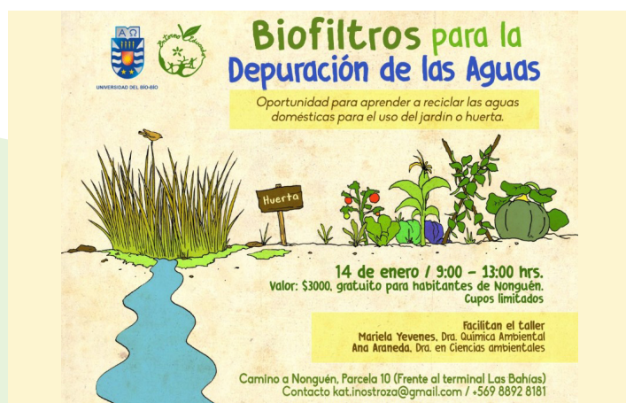
Fig. 3: Poster advertising the talk given by the experts in biofilters.

Finally, the third and still pending phase consists in introducing Californian earthworms and wetland plants. The school community will then connect the worm filter to the school’s greywater sewage and manage the irrigation of the garden with the filtered water.