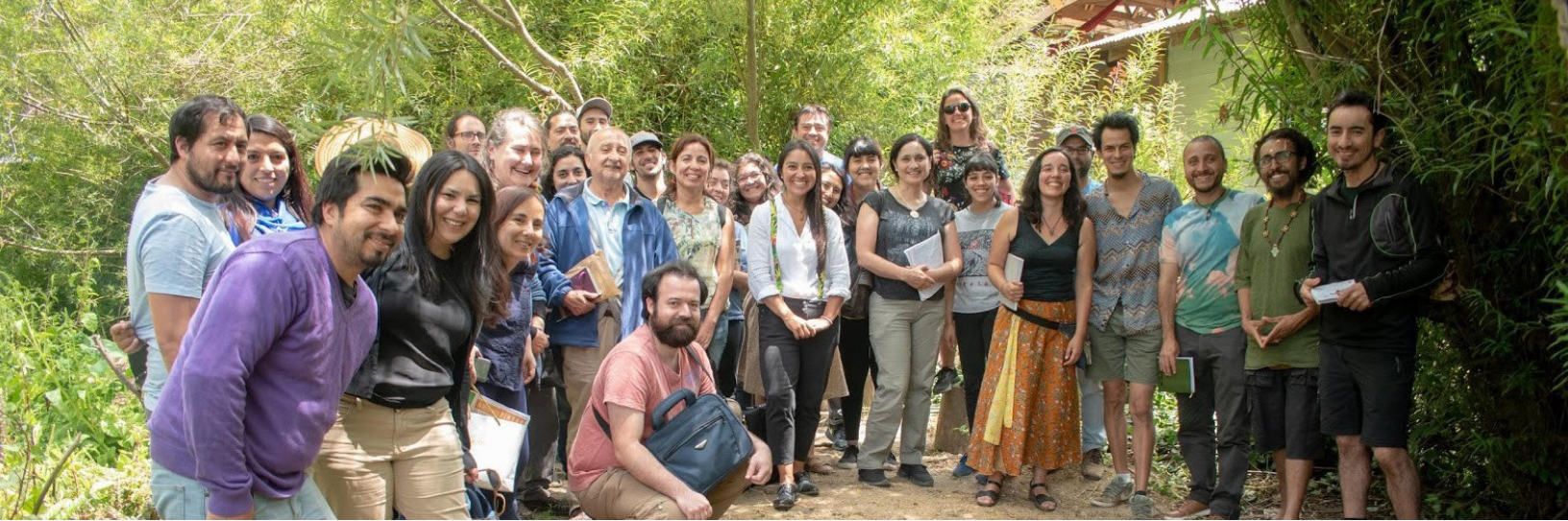
Fig. 5: First worm filter workshop with members of the educational initiative “Entorno Educador,” experts in the theme, members of the surrounding community as well as participants from more distant communities.