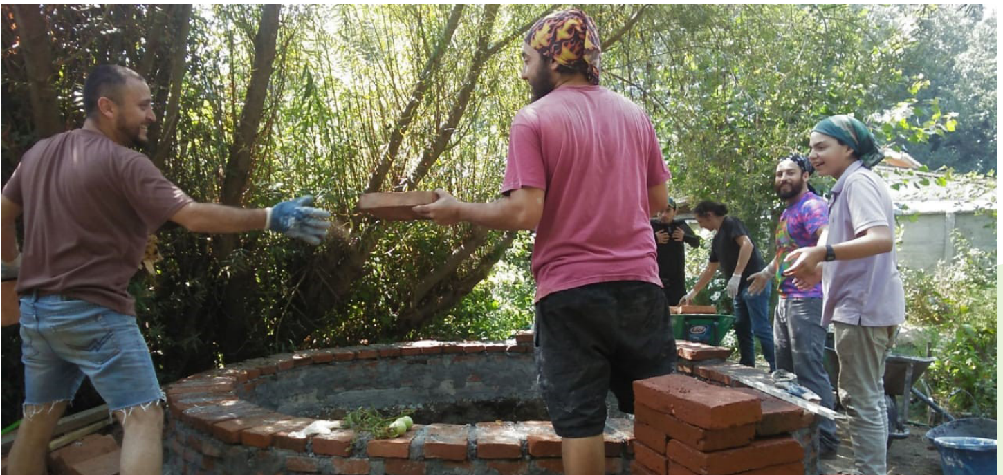
Fig. 1: Construction of the worm filter.

These two experts — a teacher at the school and a researcher at EULA, an environmental science centre located at the Universidad de Concepción — also offered training in permaculture. Permaculture is an approach to land management that reproduces phenomena observed in flourishing natural ecosystems. It was originally developed by Bill Mollison and David Holmgren in response to industrial approaches to agriculture. The contribution of skilled specialists in biological water treatment techniques and permaculture strengthened the motivation of schoolteachers, parents, children, and residents to adapt the school garden for permaculture.