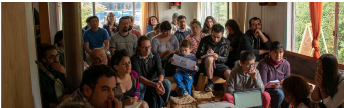
Fig. 6: Day of the talk.

The Universidad del Bío-Bío acted as a sponsor, contacting local leaders, and financing the proposed initiative with the ADAPTO funds. It is expected that the filter will be completed within the budget. The participatory approach strengthened ties in the school community and reinforced relations between participants, friends, residents, and men and women of different ages from the Nonguén community. As a result, collective synergies were created within the school community. These synergies are reflected in the sustained momentum and the collective “mingas,” the awareness of the responsible use of water, and the conservation of the water resources in the territory. This said, it is also important to mention that miscommunications occurred between and among leaders and participants at several points during the implementation process. At crucial moments, this lack of clarity and openness generated avoidable conflicts that took a heavy emotional toll on the individuals involved.