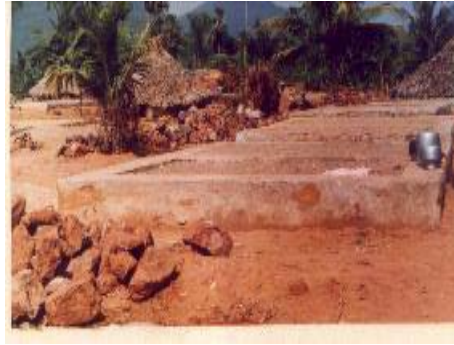
Locally available resources

1990, 1995 and 1996 cyclones. In the reconstruction work after these cyclones, NASA utilized the emotional situations to foster unity among dalits and inspire them to build their own future. Housing provides the best opportunity for such a committed community organization work. The people's organizations are motivated to complete the project by introducing locally feasible cost effective technology, participative, transparent and accountable systems. NASA made use locally available resources for housing such as bricks, rough stones, sand, deadwood etc., to the optimum level. NASA has so far constructed more than 8,000 permanent houses. So far 18,000 acres of land was acquired and developed with special focus on watershed management and by introducing appropriate land development practices. This has immensely contributed to the socio-economic advancement of the dalits. NASA's documents showed that it has promoted 5,000 self-help groups ranging from 10 to 15 members per group and there are 60,000 women involved. They are federated at the macro level as cooperative societies. They are involved in savings, credit, skill development, and income generation and as active participants in socio-economic and political empowerment processes.