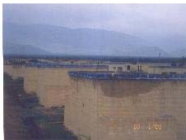
Kurnool Terrace Roofing

The people did not bother about the poor quality of construction and unsystematic infrastructure development because they neither got involved nor contributed anything in cash or kind. Only 850 houses were constructed at a cost of Rs.20,000/- per house of 144 sq.ft. as per the government's prescribed sizes. The