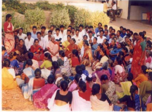
Community Based Organization- Meeting

out-migration for paid labour. A few hundred SHGs of women's federations became the cooperative society, which takes care of the staff of BREDS as their employees and replaced the NGO and marching ahead as a mandal.