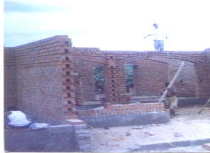
Rat Trap Technology

PARA introduced a new technology promoted by Laurie Baker. Rat Trap construction for the walls and filler roofing for the slabs were used, which reduced the cost by 20%. PARA's office building was also constructed by using this technology. The local masons were also trained in acquiring skills in the newly introduced technology.